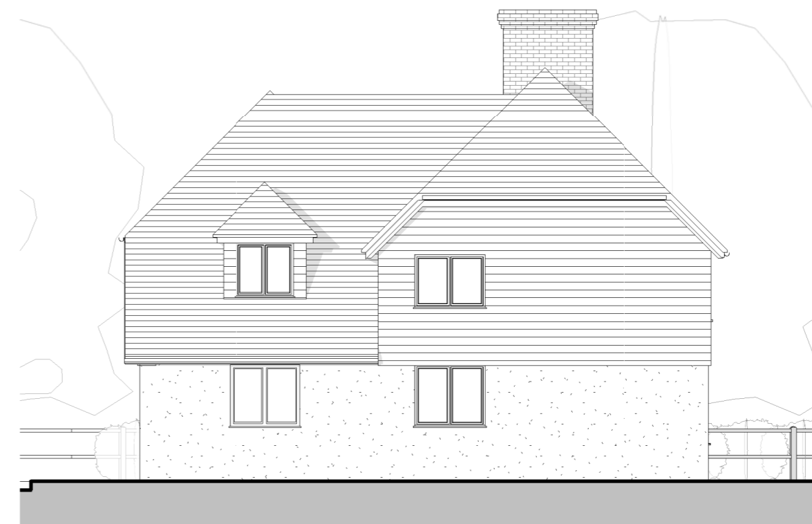
Plot 2 - Kents Oak - South West Elevation as Proposed 1:100