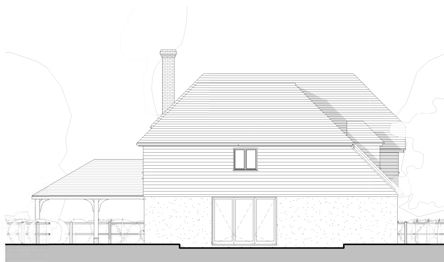
Plot 2 - Kents Oak - North West Elevation as Proposed 1:100