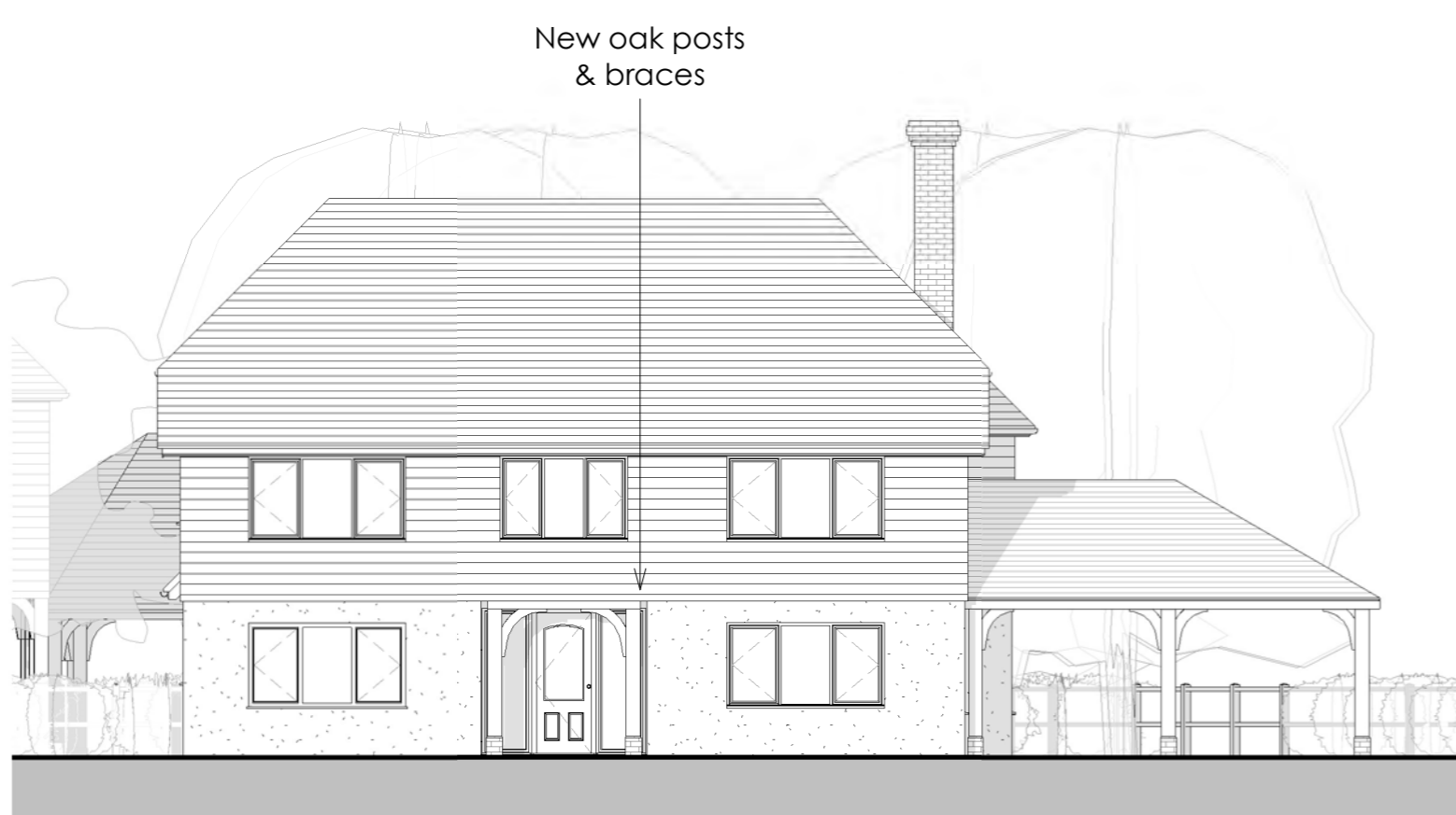
Plot 2 - South East Elevation as Proposed 1:100