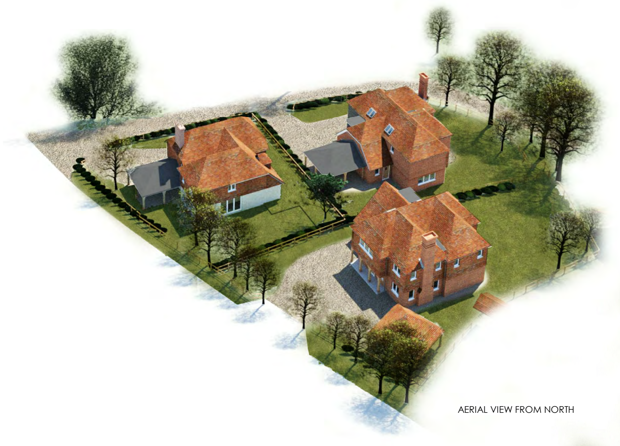
AERIAL VIEW FROM NORTH