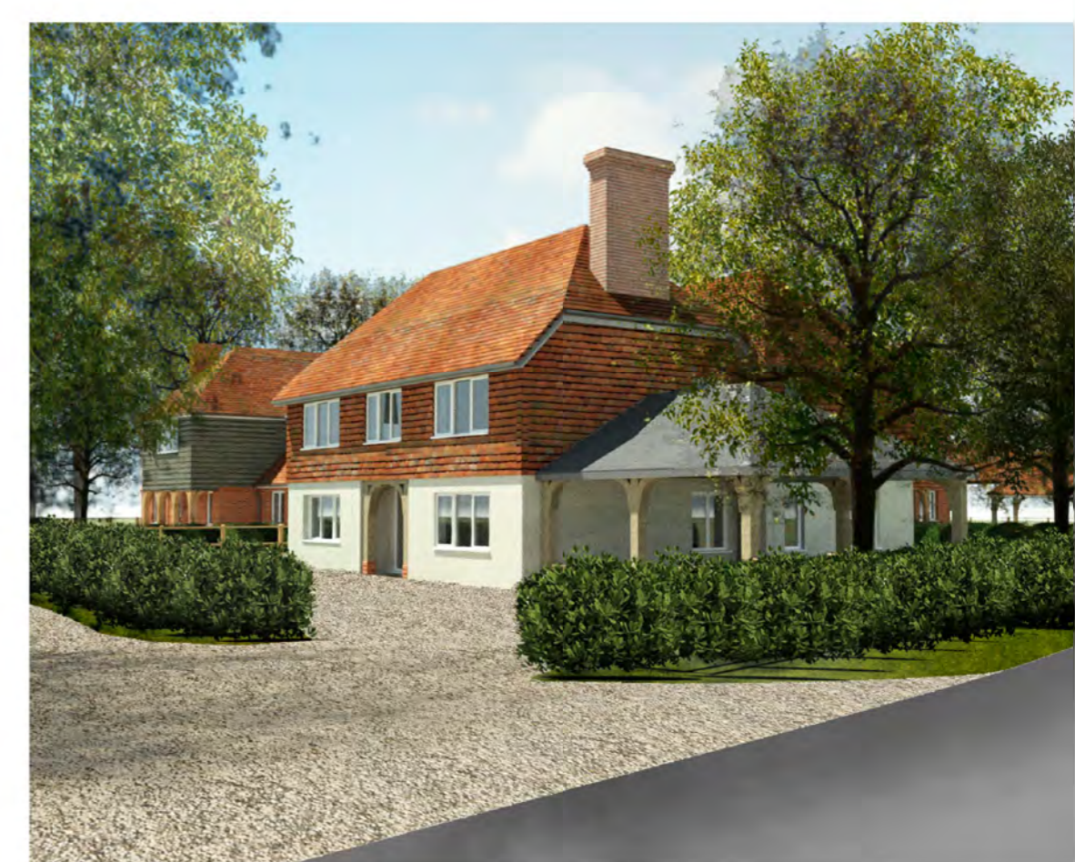
PLOT 2 - VIEW FROM LOCKERLEY ROAD