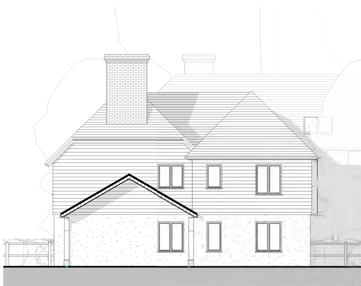
Plot 2 - Kents Oak - North East Elevation as Proposed 1:100