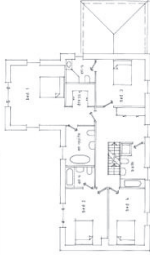
first floor plan