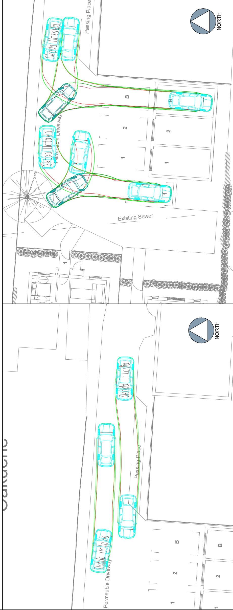
PASSING VEHICLES AT SITE ACCESS (SCALE: 1:200)