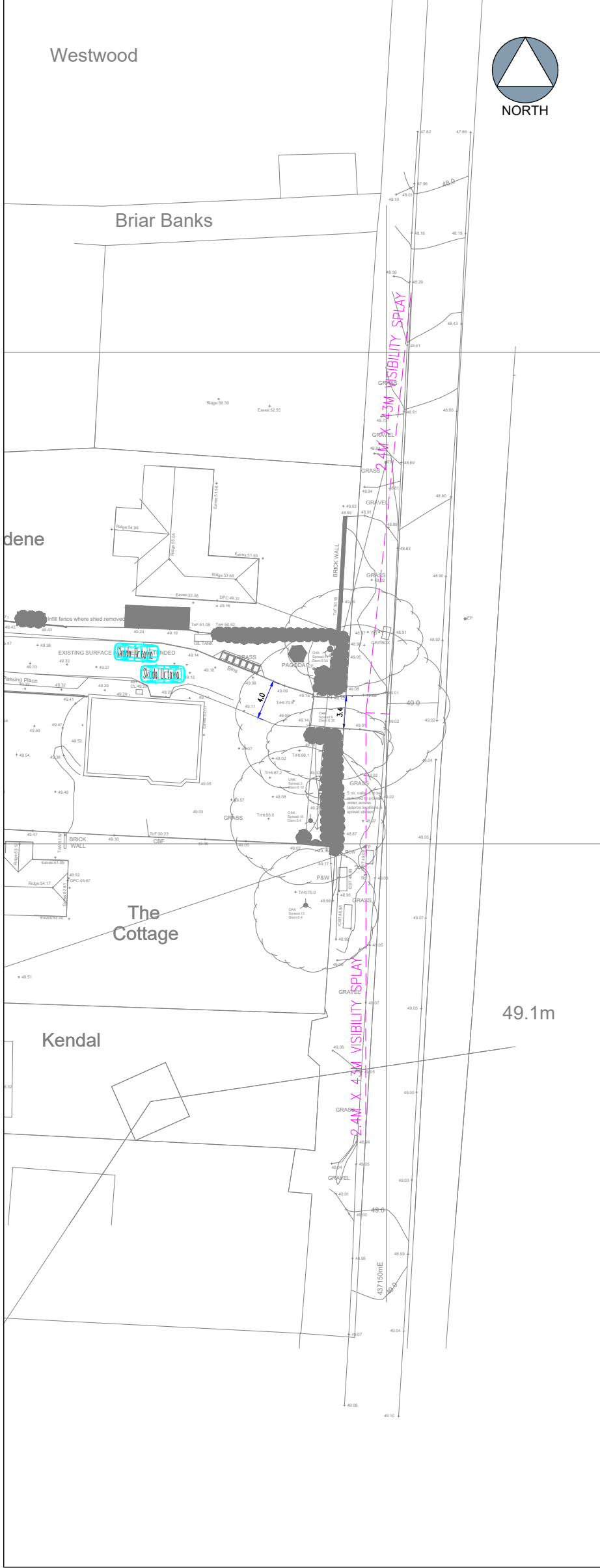
VISIBILITY SPLAY (SCALE: 1:500)