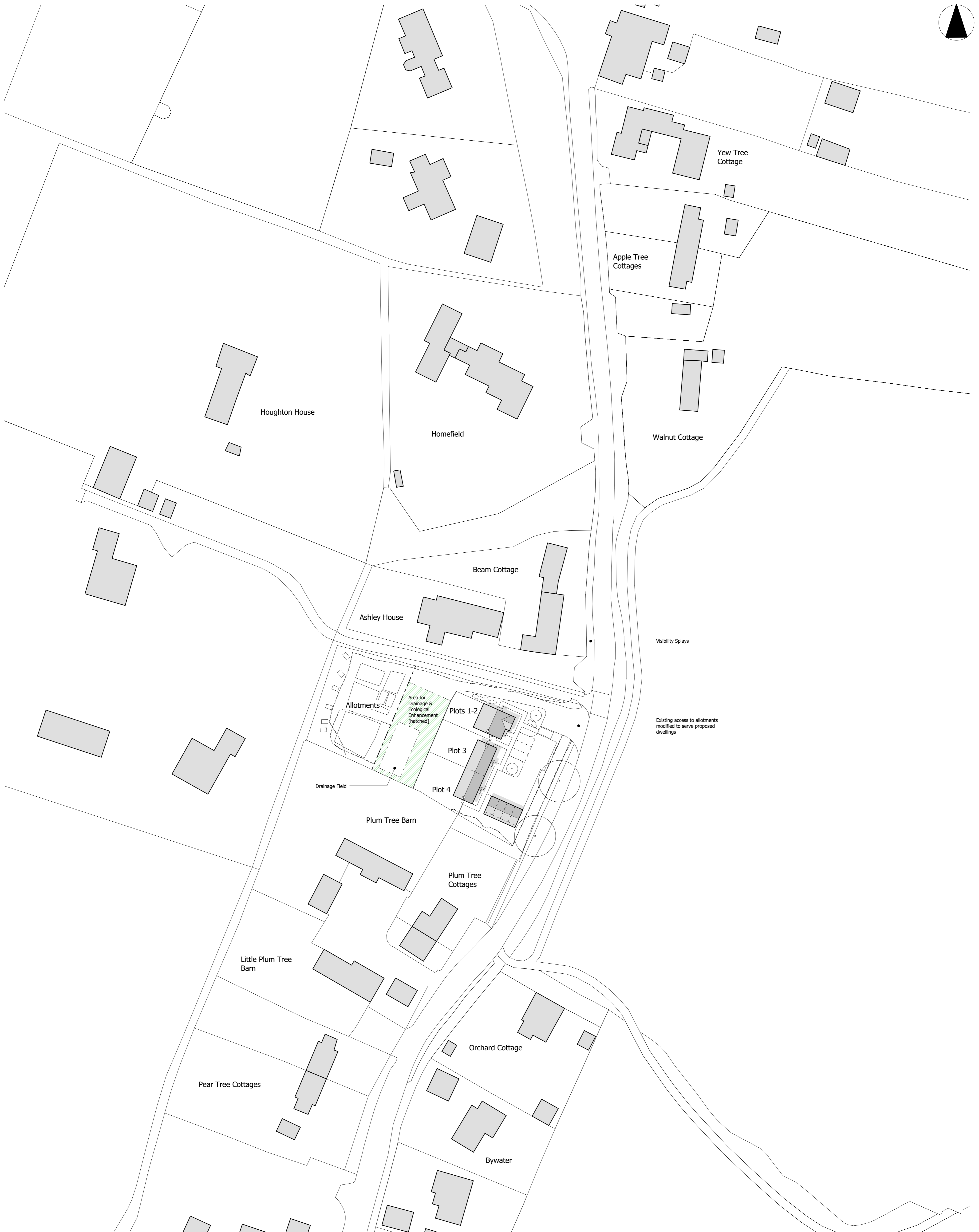
Proposed Site Layout [1:500]