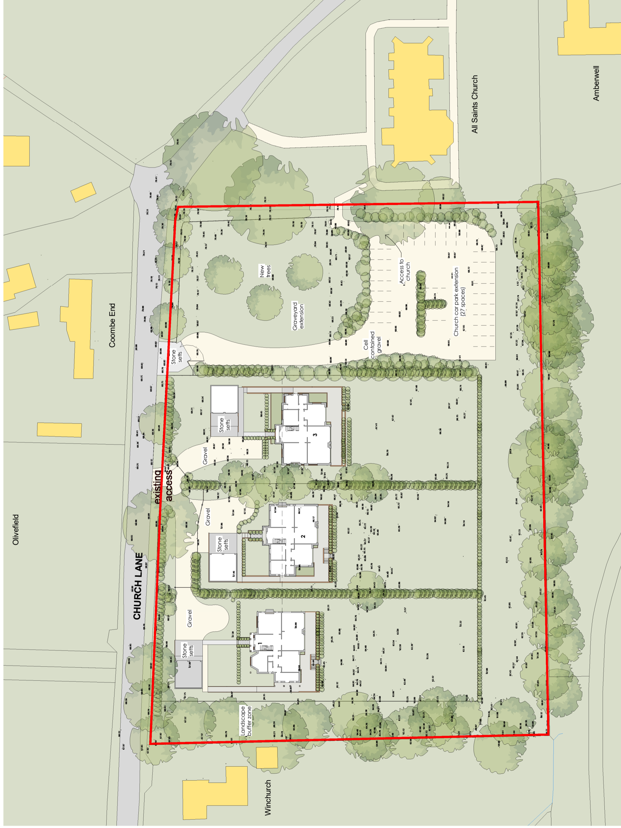
Site Plan as Proposed 1:500