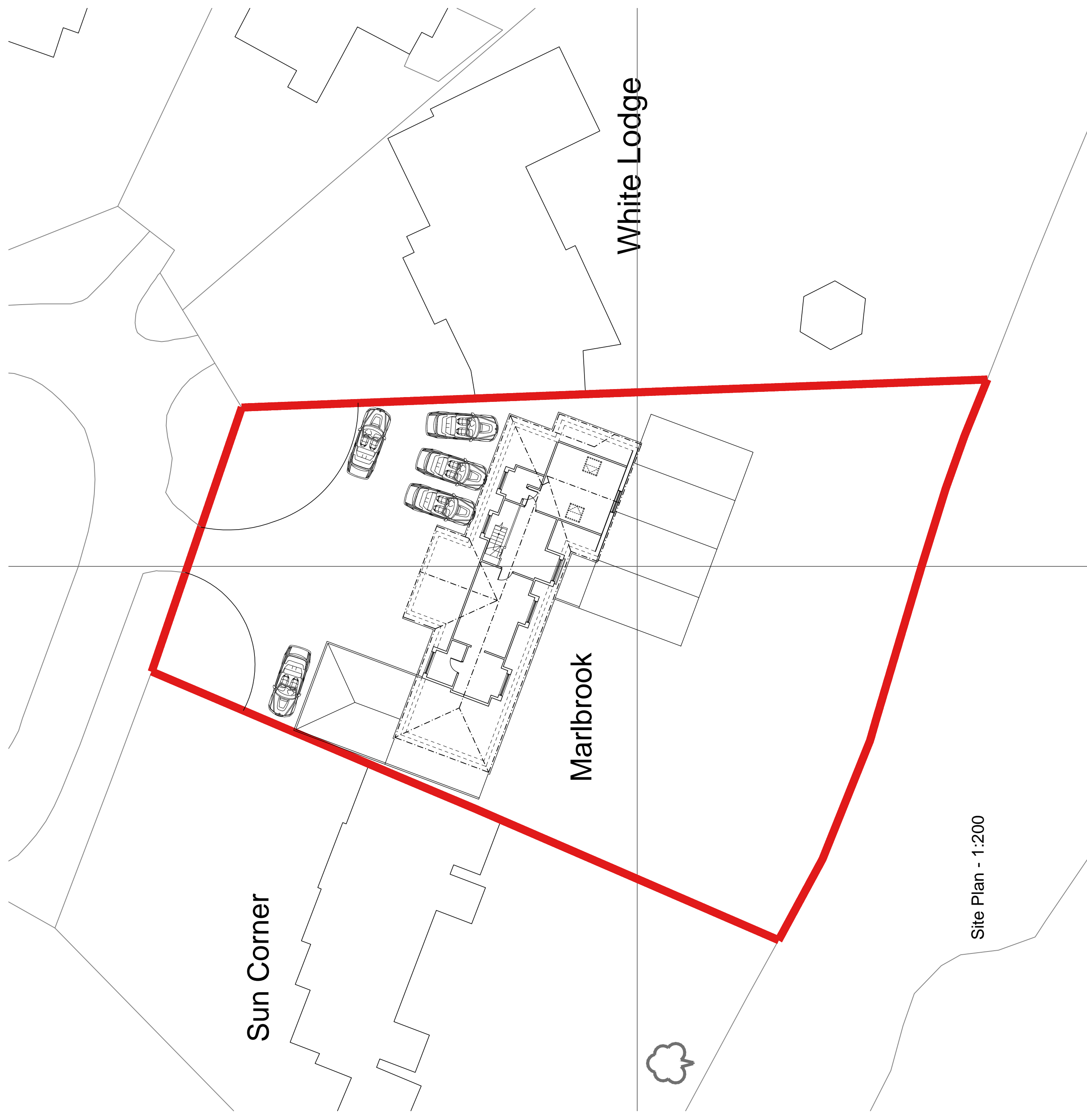
Site Plan - 1:200

THIS DRAWING IS THE PROPERTY OF PARIO ARCHITECTURE AND IS NOT TO BE REPRODUCED OR COPIED IN ANY MANNER WITHOUT THE WRITTEN PERMISSION OF PARIO ARCHITECTURE. THE INFORMATION CONTAINED HEREIN IS FOR THE EXCLUSIVE USE OF THE CLIENT AND IS NOT TO BE USED FOR ANY OTHER PURPOSE. THE CLIENT ACCEPTS FULL RESPONSIBILITY FOR THE ACCURACY OF THE INFORMATION PROVIDED. THIS DRAWING IS NOT TO BE USED IN CONNECTION WITH ANY OTHER DRAWING OR SPECIFICATION PREPARED BY PARIO ARCHITECTURE WITHOUT THE WRITTEN PERMISSION OF PARIO ARCHITECTURE.