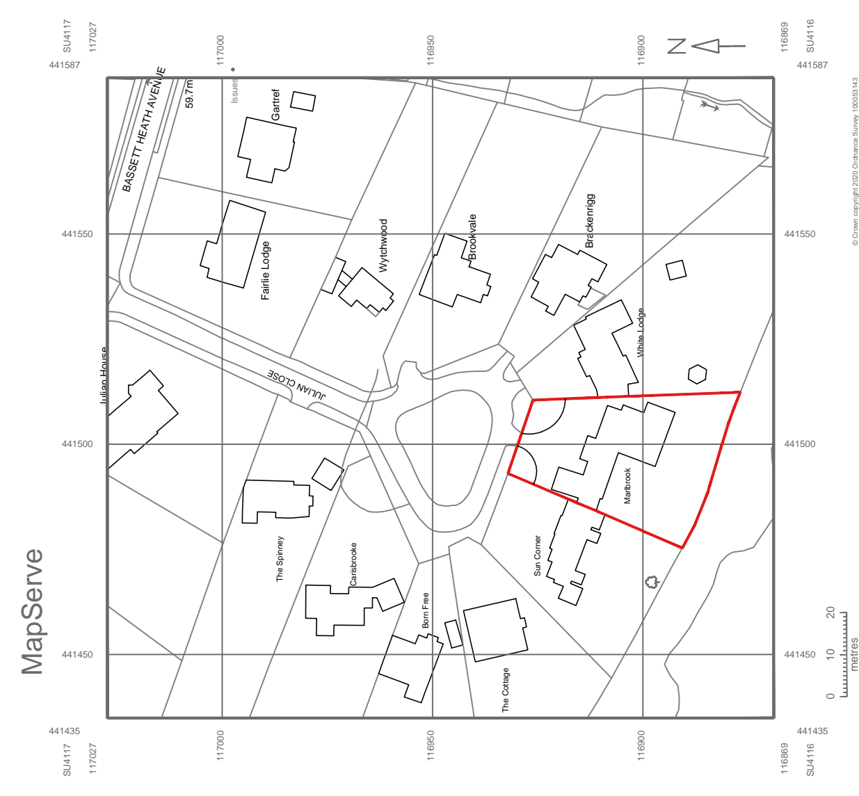
Site Location Plan - 1:1250