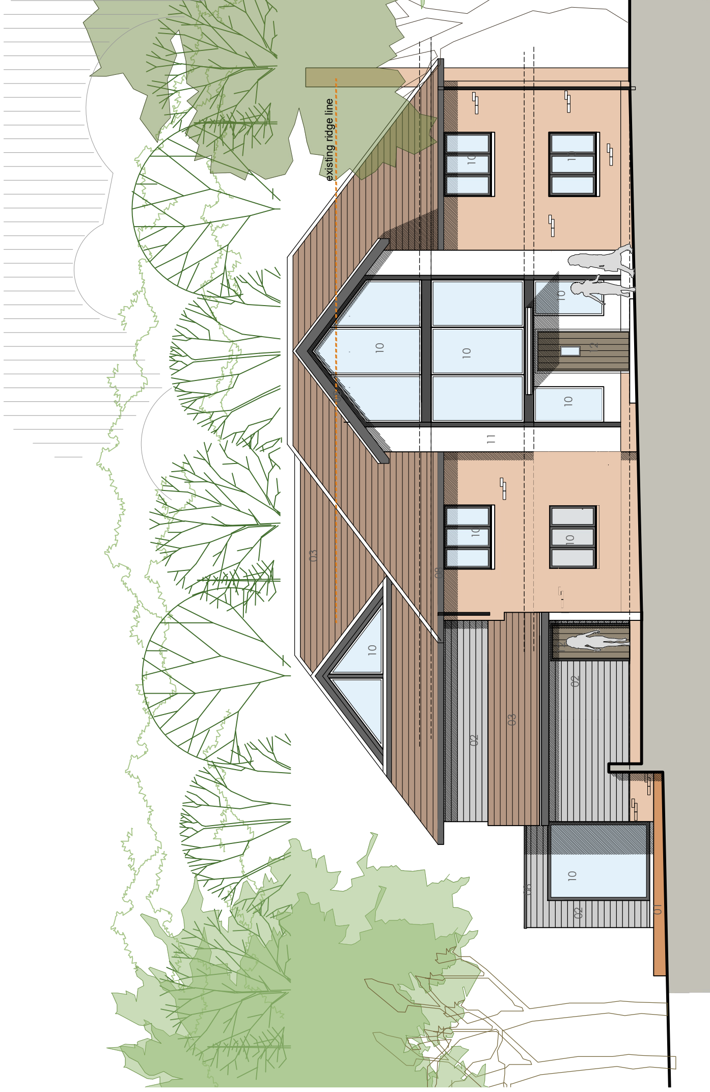
01 Proposed front elevation 1:100

This drawing is copyright and is not to be reproduced. The contractor will be held responsible for the accuracy of works involving the setting out and checking of all dimensions on the drawing and on site. Dimensions must not be scaled from this drawing.