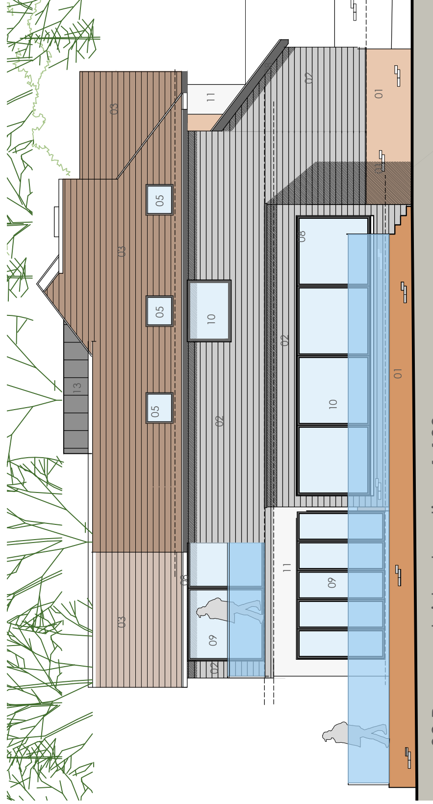
02 Proposed side elevation 1:100