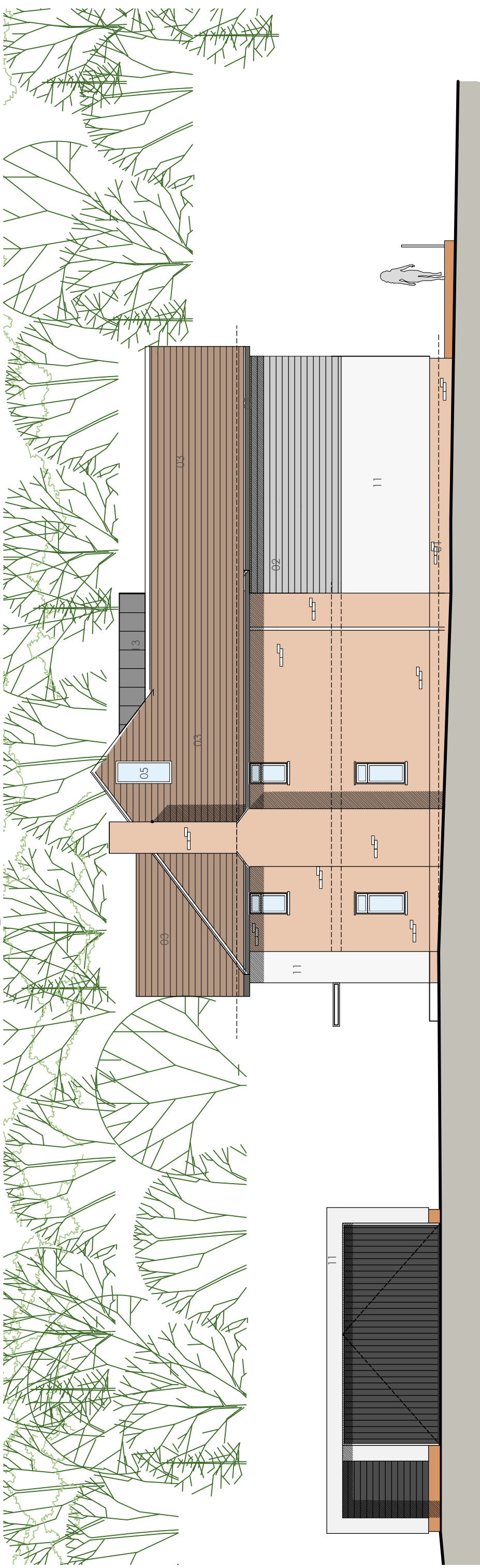
04 Proposed side elevation 1:100

This drawing is copyright and is not to be reproduced. The contractor will be held responsible for the accuracy of works involving the setting out and checking of all dimensions on the drawing and on site. Dimensions must not be scaled from this drawing.