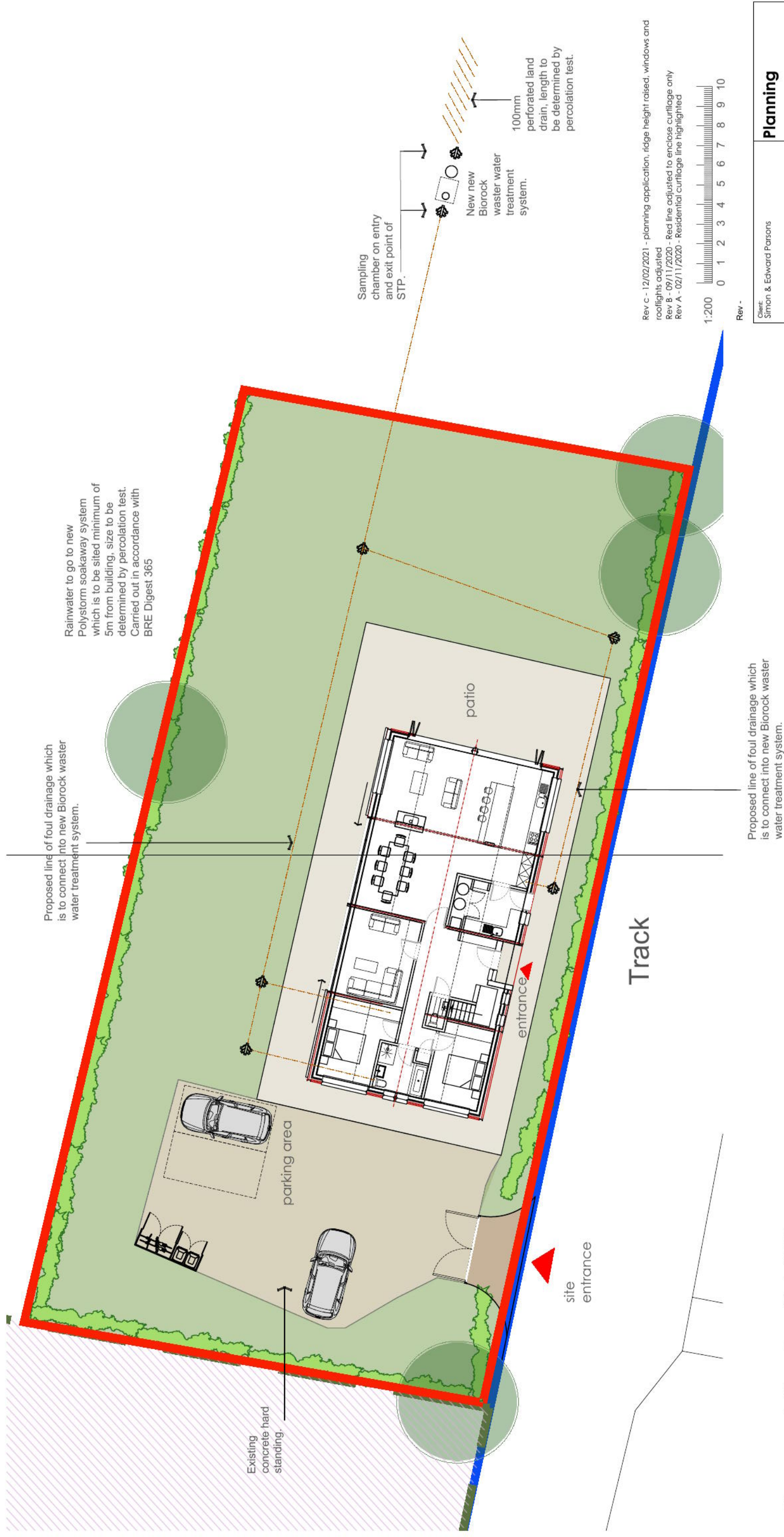
Proposed site plan @ 1:200

This drawing is copyright and is not to be reproduced. The contractor will be held responsible for the accuracy of works involving the setting out and checking of all dimensions on the drawing and on site. Dimensions must not be scaled from this drawing.