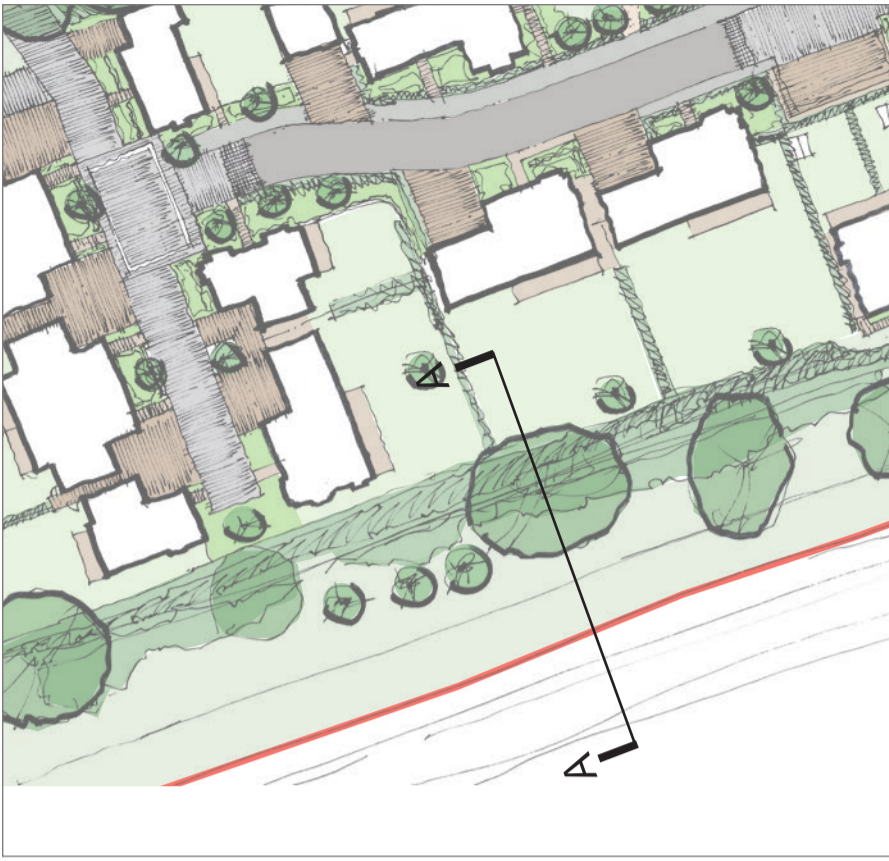
Location plan NTS