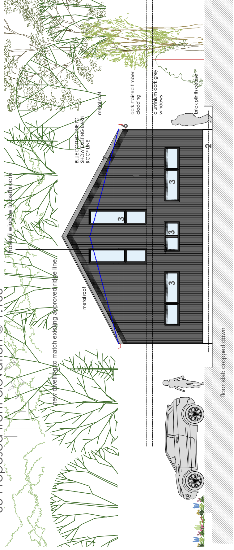
04-Proposed side gable elevation @ 1:100