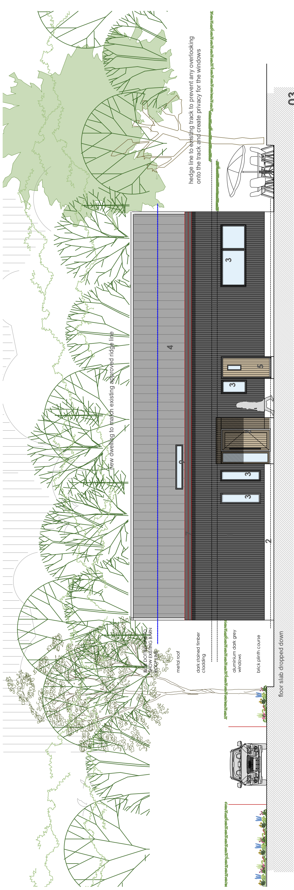
03-Proposed front elevation @ 1:100

This drawing is copyright and is not to be reproduced. The contractor will be held responsible for the accuracy of works involving the setting out and checking of all dimensions on the drawing and on site. Dimensions must not be scaled from this drawing.